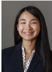
AILA CO OHIO STATE UNIV COM